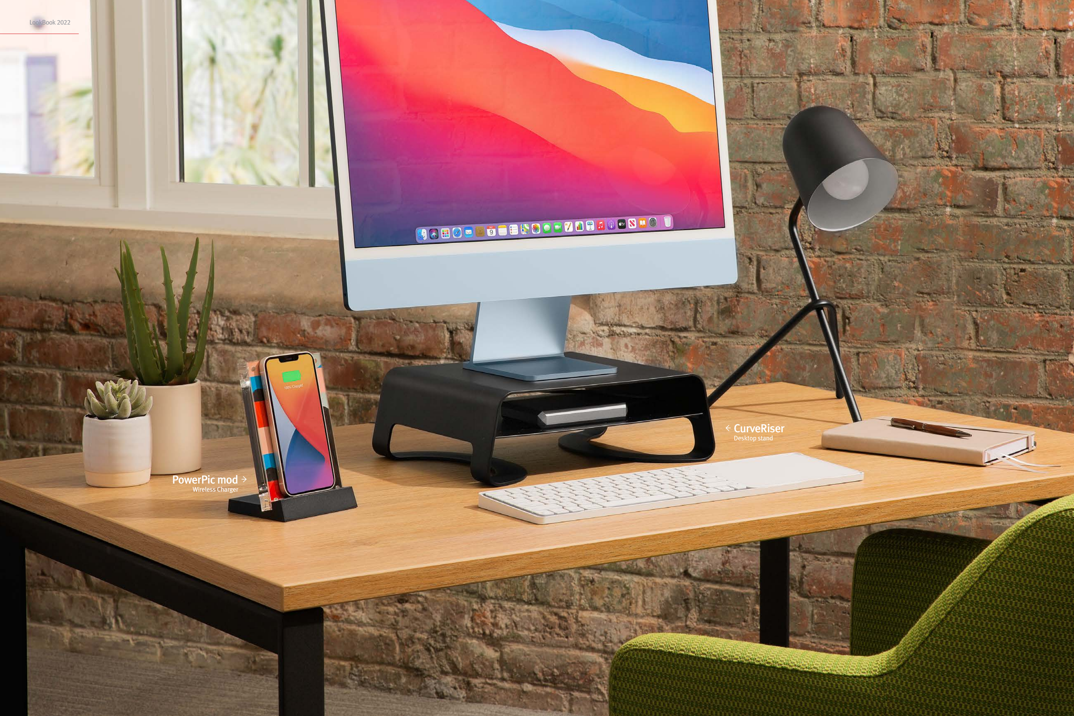
PowerPic mod → Wireless Charger