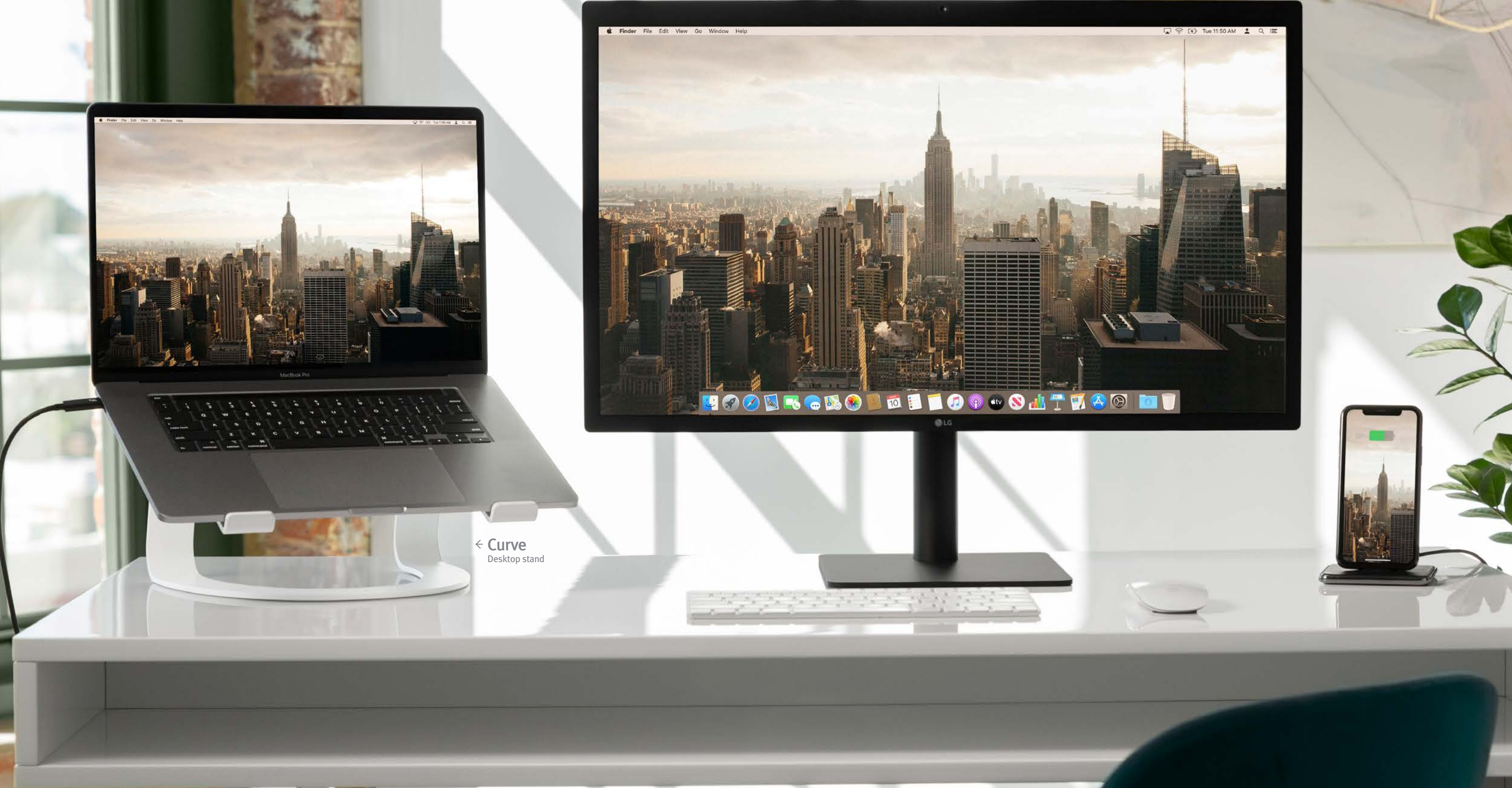
← Curve Desktop stand