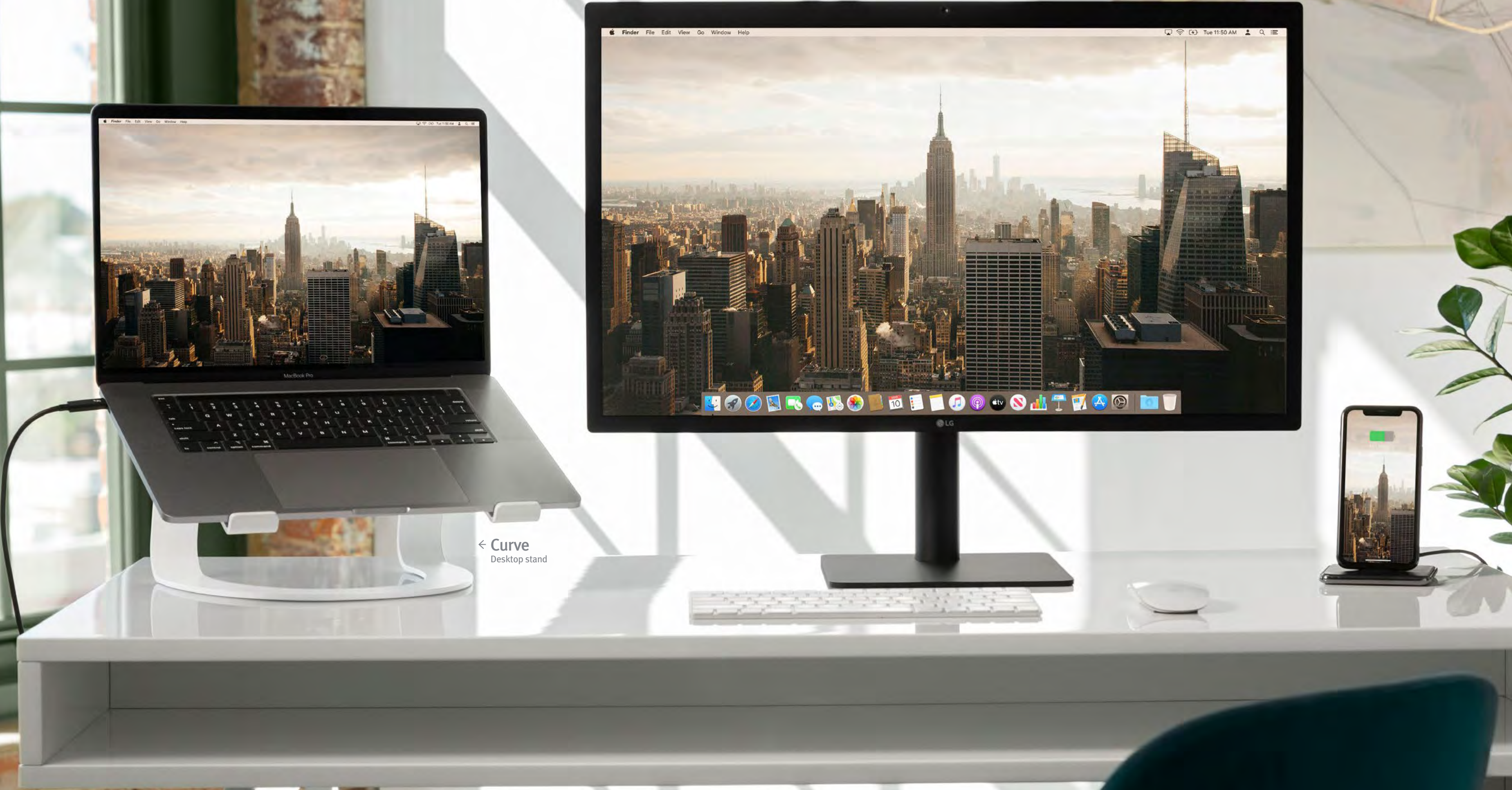
← Curve Desktop stand